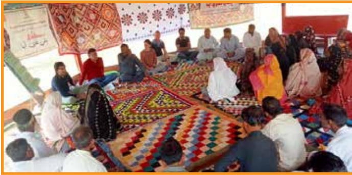
Thatta & Badin / October 2 & 3, 2023