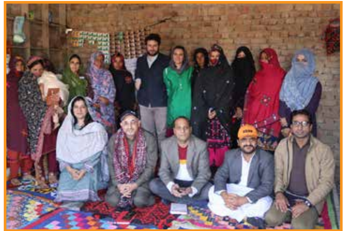
Jacobabad/December 04, 2023