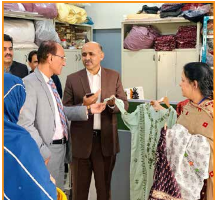
SRSO Complex Sukkur/December 18, 2023

This visit aimed to recognize the efforts of these entrepreneurs/BDGs and the support from the Government of Sindh. The SRSO's dedication to empowering women and eradicating poverty on a sustainable basis was also acknowledged by the delegation. It was an opportunity to observe firsthand the impact of PPRP-GoS and other initiatives implemented by the Sindh Rural Support Organization (SRSO) at the grassroots level.